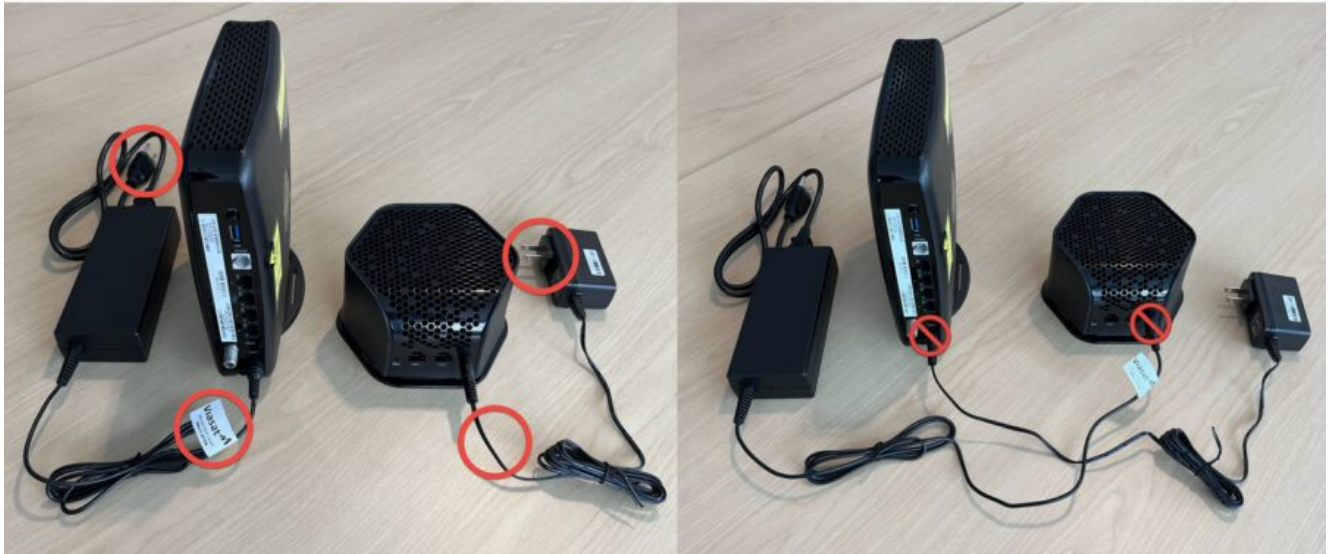
Correct / Incorrect power cord installation