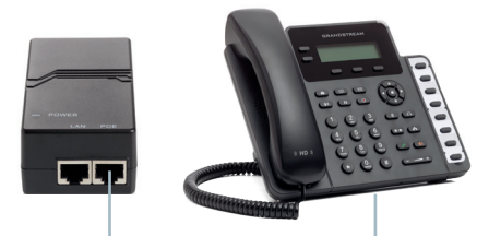
LAN port located on back of phone

Repeat this step for each additional PoE injector.